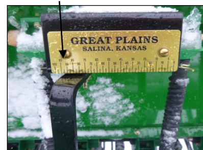
Small Seed Box (set to 86)